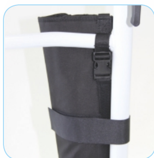
Oxygen bottle holder

Platform is CE-marked and fulfills the requirements of EU directive 93/42 EEC for medical devices.