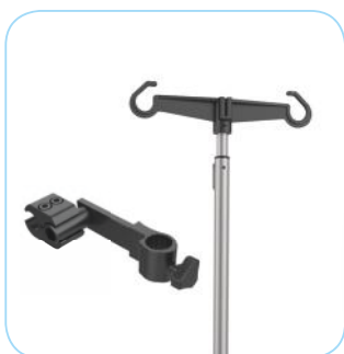
Infusion standard with holder