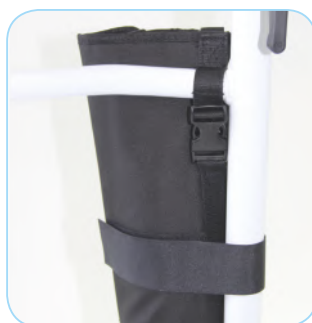
Oxygen bottle holder